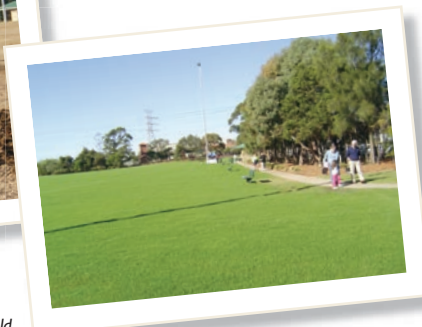
Above: Before and after pictures of the field